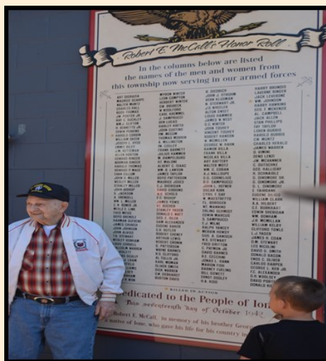
Plaque Dedication Honoring Ione's Men and Women who served in World War II, April 2016

Tax # 68-0447992 A 501 (C3) organization